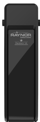
Prodigy III™ 98022RGD Jackshaft, DC battery backup with WiFi and Bluetooth.