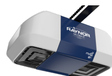
Ultra II™ with WiFi™ 85870RGD ¾ HP chain-drive with WiFi and Bluetooth, when you need maximum performance.