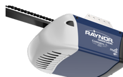
Corporal II™ with WiFi 81650RGD ½ HP chain-drive, lasting performance and dependable operation.