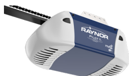
Pilot II™ with WiFi™ 83650RGD-267 ½ HP chain-drive with WiFi, smooth, effortless operation.