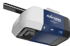
Sergeant II™ with WiFi 81602RGD ½ HP DC battery backup chain- drive, trusted reliability and quiet operation.