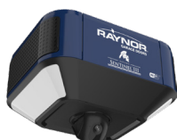
Raynor Sentinel™ III 84505RRGD DC LED belt-drive with WiFi and integrated camera.