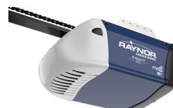
Airman II™ with WiFi 81550RGD ½ HP belt-drive, durable, reliable performance.